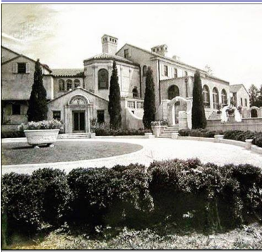
The Villa Marina