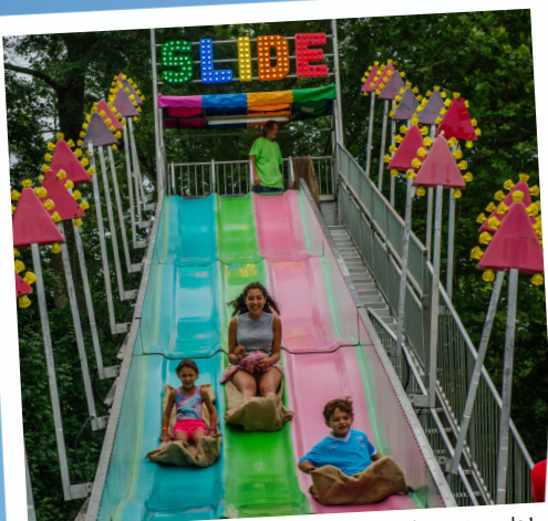
Carníval is a camp favorite - and it's Back!