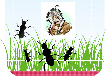
www.piercecamps.com www.campbirchmont.com www.piercecountrydayschool.com